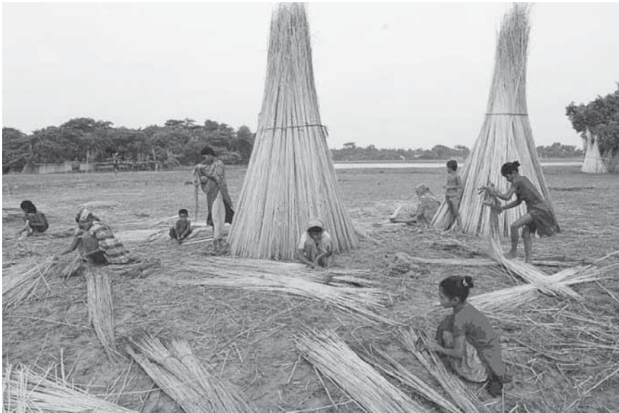
Figure 2. The girls of the rural community of project area are working before going to school in the morning.