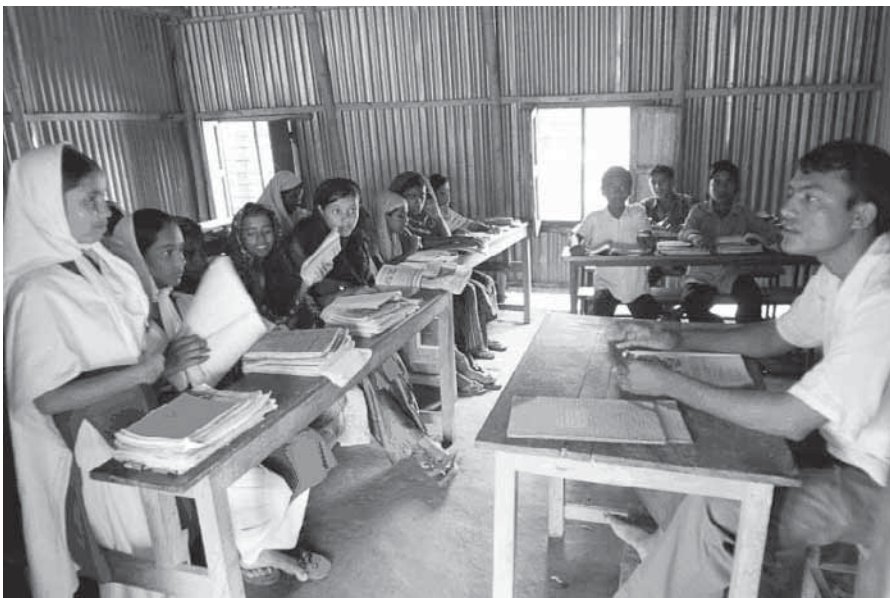
Figure 3. The teacher of agriculture is taking class on vocational courses for e-skills development