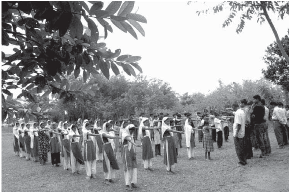
Figure 4. The students are taking oath along with teachers before going to the classes.

AAIT group is transforming attitudes, inspiring interest and preparing young people with the technology-related knowledge and skills employers need. AAIT is also transforming the attitudes of young people to IT-related education and careers.