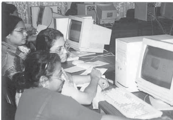
Figure 1. Senior women scientists, technologists and researchers in ICT Training course held in November 1997